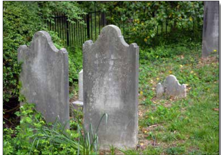
Family graveyard at Belmont