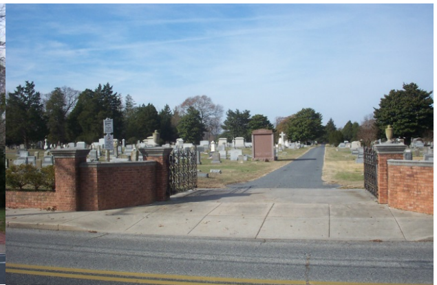
Parsons Cemetery – Division St. Entrance