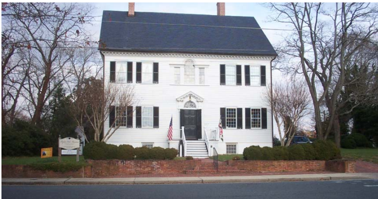
Poplar Hill Mansion

PLEASE: Remember the deadline for registration is April 12 th . Form is included in this issue.